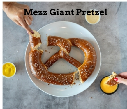
Mezz Giant Pretzel