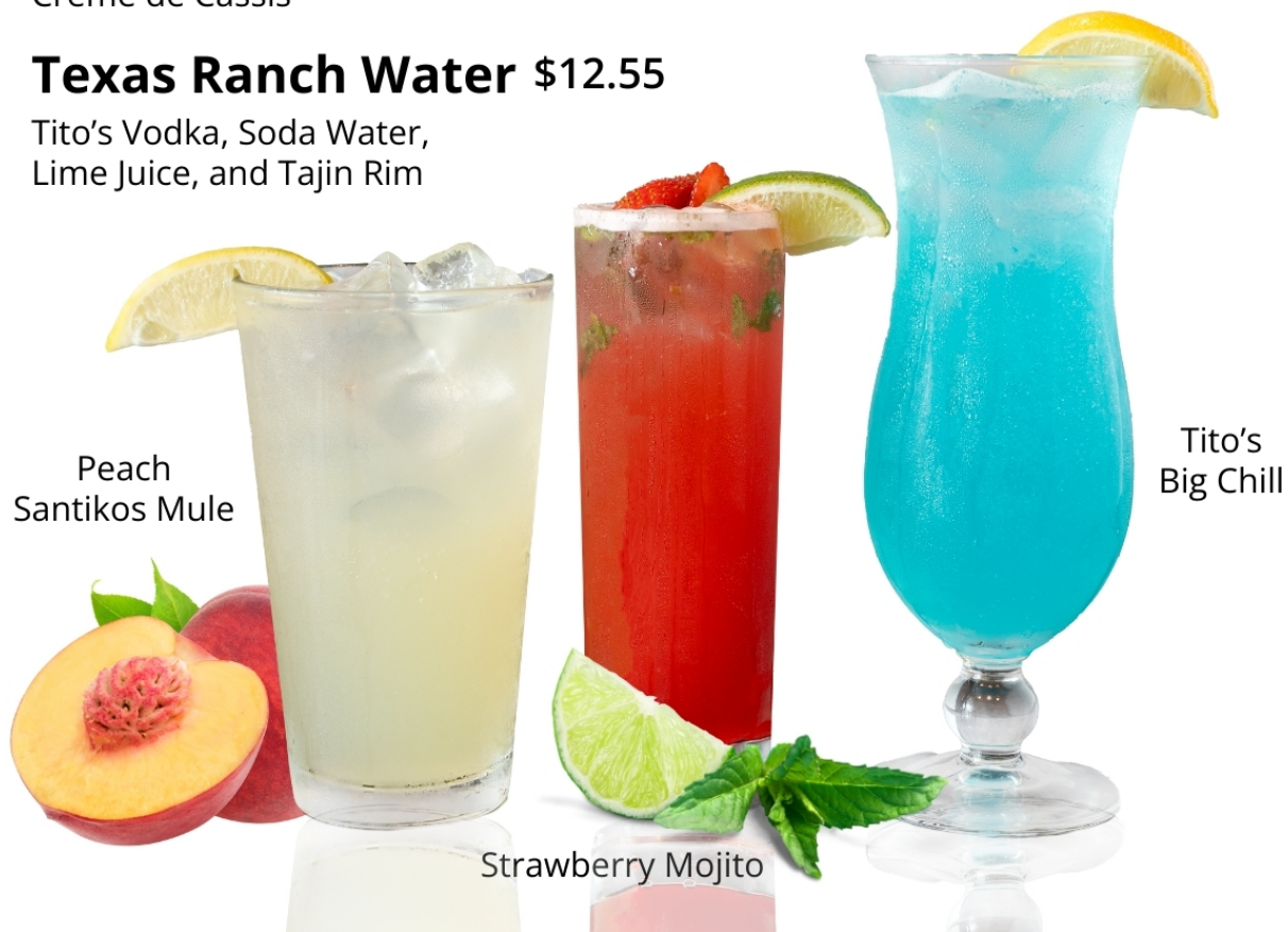
Peach Santikos Mule

Add a flavored liqueur +0.50 Raspberry, Peach, or Melon