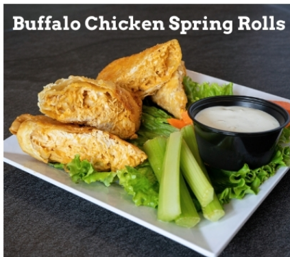
Buffalo Chicken Spring Rolls