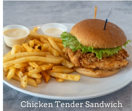
Chicken Tender Sandwich