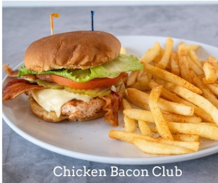
Chicken Bacon Club